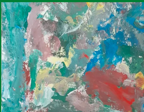
Aruna C Age 01-05

Our mind has its own little critic that will force us to ask ourselves a basic question "Will anyone like my work?" Well, there might not be a way to stop that little voice in your head but we can try a different concept every time this question pops up in our head.