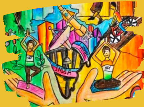
Nisha Art Fest Winner