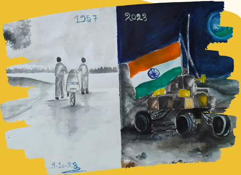
Pamela Age 11-15