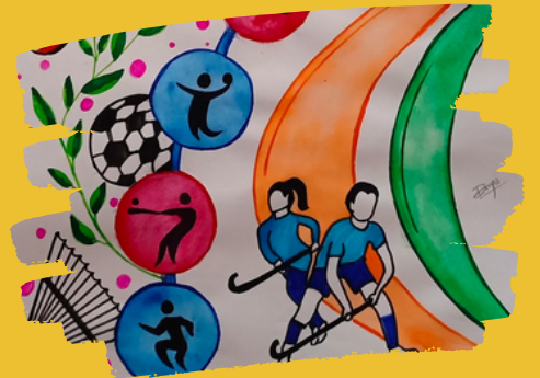
Divya Art Fest Winner