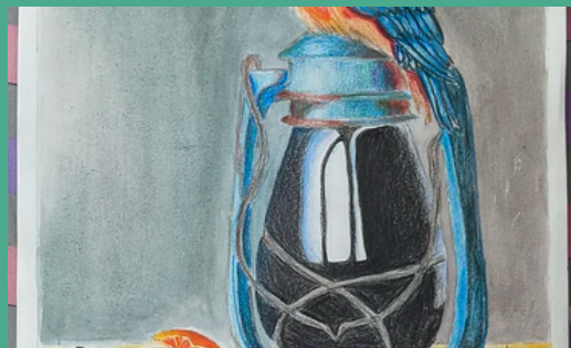
Swasti S Art Fest Winner